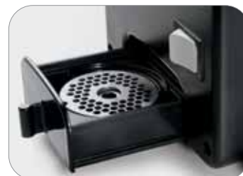
Cassetto porta coltello e piastra Compartment for knife and blade