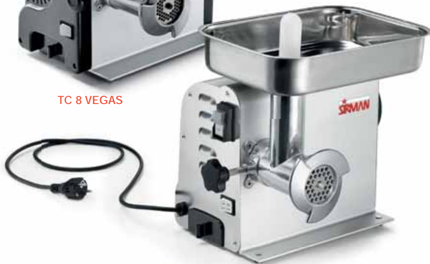
TC 8 VEGAS FX