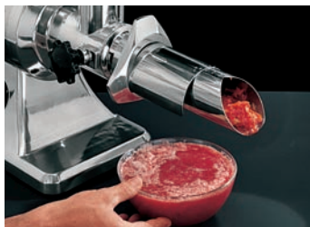
Passapomodoro per TC/TCG 22E