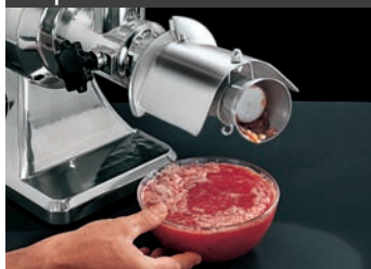
Passapomodoro per TC/TCG 12E